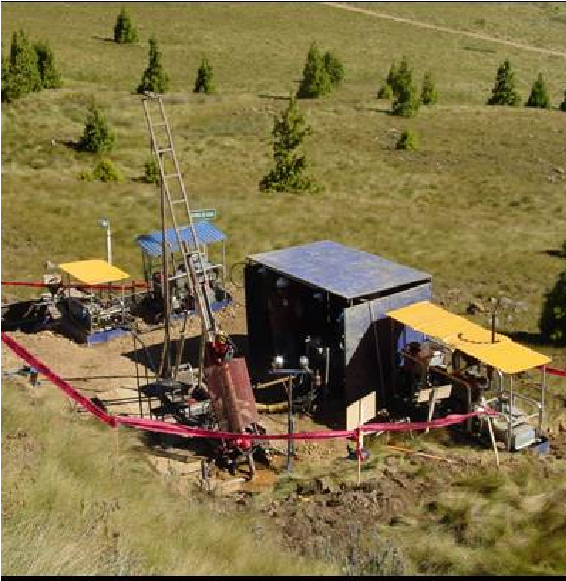
"Explorer Plus MD" working at Yanacocha in Peru"